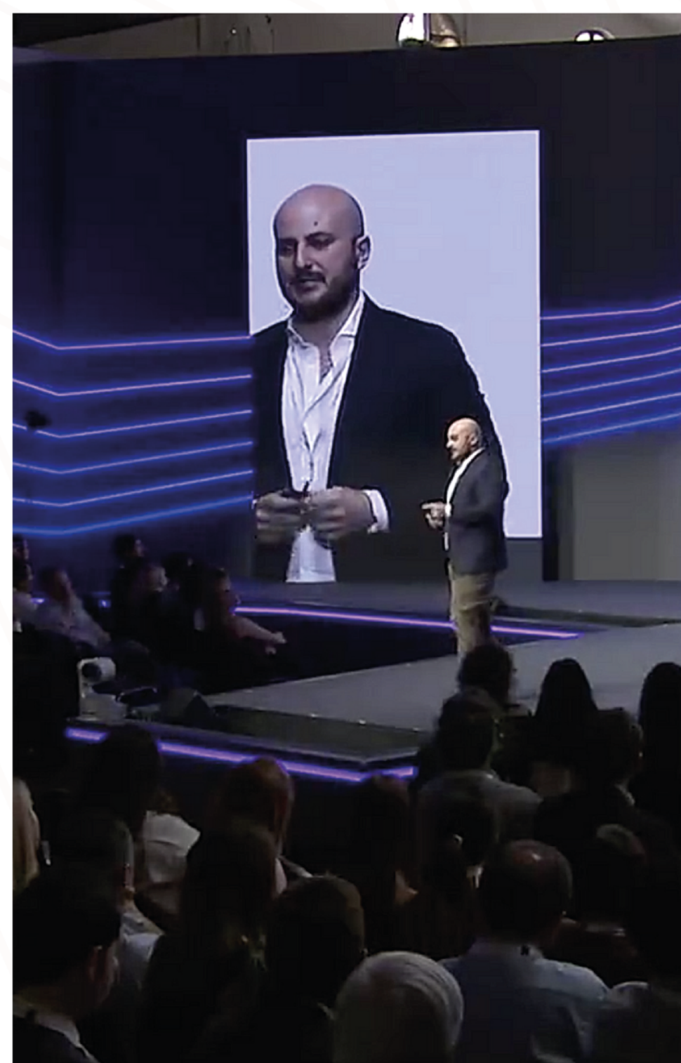
ENEL National Convention