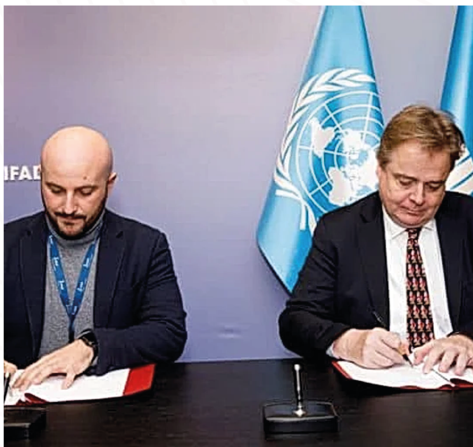
Partnership with UNITED NATION agency (IFAD)