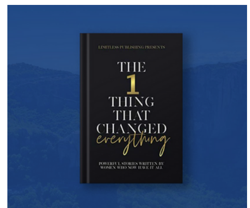
The 1 Thing That Changed Everything Powerful Stories Written By Women Who Now Have It All