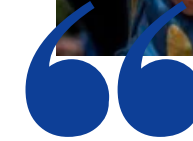
GUILLERMO CASET ONE OF THE BEST POLO PLAYERS IN THE WORLD

“Flor has the unique capacity to change your mentality , raise your motivation and give you science based methods that help you perform at your best”