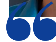
JOHN GRAY BESTSELLING AUTHOR OF "MEN ARE FROM MARS, WOMEN ARE FROM VENUS"

"Her work is so impressive! The tools she teaches can quickly transform your life, your business, your relationships. She is powerful! "