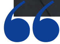
JACK CANFIELD BESTSELLING AUTHOR, TEACHER AT "THE SECRET" MOVIE