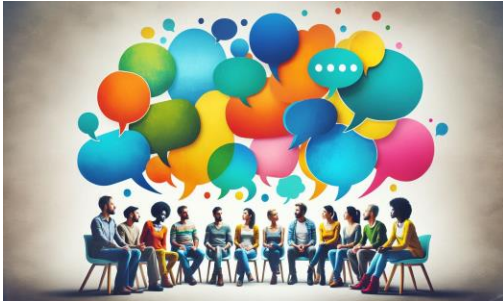
Foster open communication