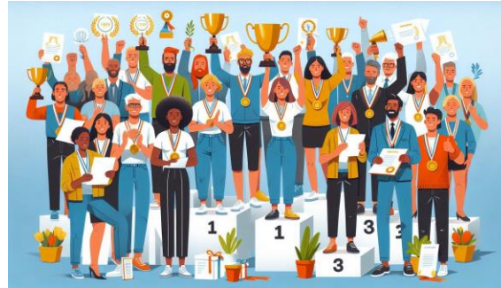
Recognise and Reward contribution