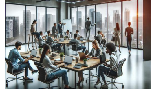
Offer flexible work arrangements