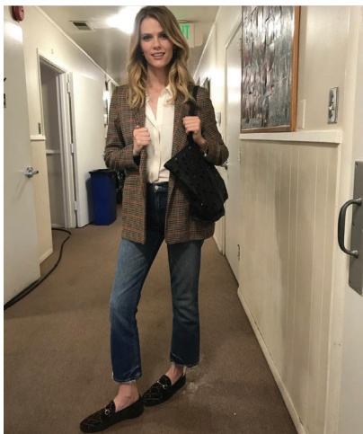
Carried by Brooklyn Decker and featured on Grace and Frankie , Season 5